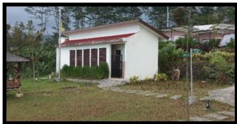
Toilets are available at several points, each with 5 bathrooms.