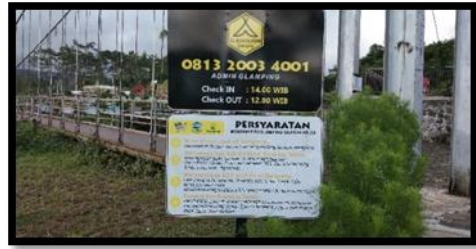
Notice board for booking rooms at glamour camping