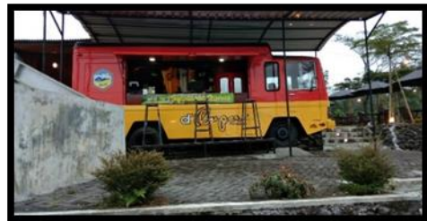
The information center provides information for tourists whether it's booking rooms, holding events etc.