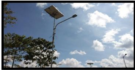
The lighting already uses solar panels and is scattered at several points.