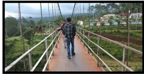
The bridge that connects the glamping area with the food court is also a photo spot.