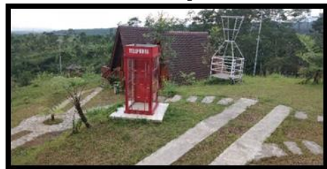
This photo spot has an old-school feel with a cable telephone station against the background of the lowland expanse of Lumajang city.