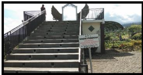
This photo spot depicts a winged figure against the backdrop of Mount Semeru