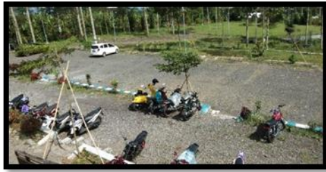
Parking for 2-wheeled and 4-wheeled vehicles